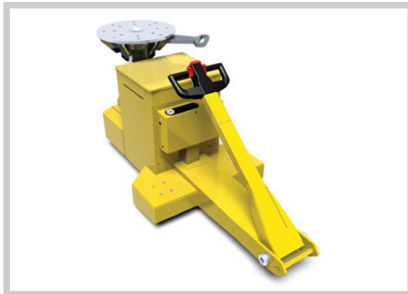
Master Tug TMS TMS30/1650